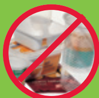
Yoghurt pots & meat trays