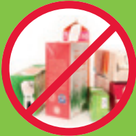
Coated juice & milk cartons