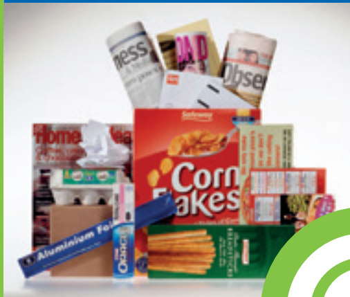
Paper, Magazines, Card, Cardboard