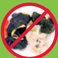
Sacks & carrier bags