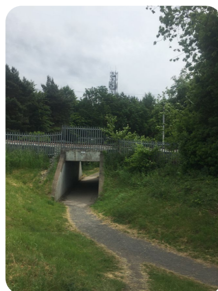
Existing underpass from north