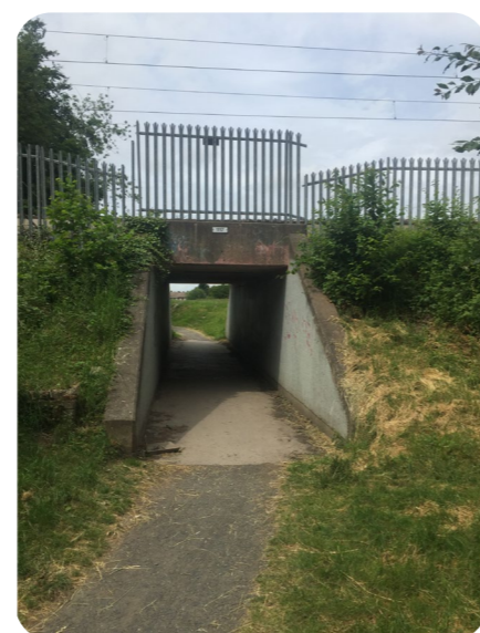
Existing underpass from south