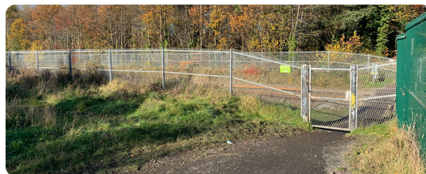
Current level crossing