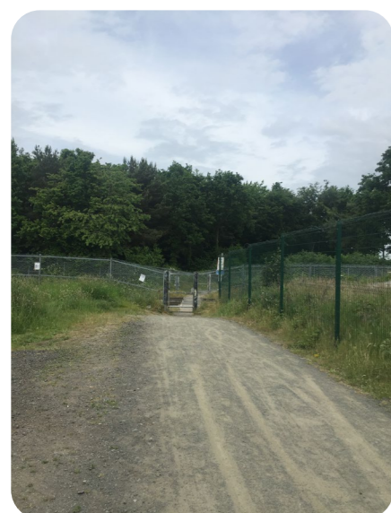
Existing level crossing looking north

Our phone line is manned by customer service staff at Northumberland County Council from 8.30am to 5pm Monday to Thursday and 8.30am to 4.30pm on Friday. The customer service staff will be able to share your enquiry with the project team and we will aim to return your call as soon as possible. If you require hard copies of any of the consultation materials, please get in touch using the details outlined on this page.