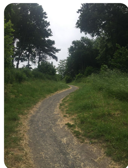
Facing south from underpass