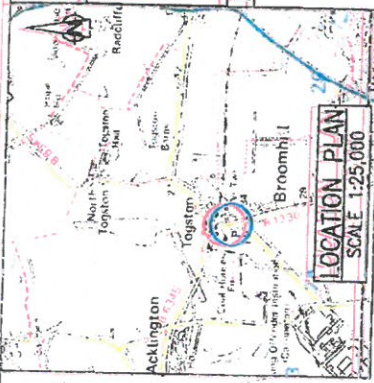
LOCATION PLAN SCALE 1:25,000