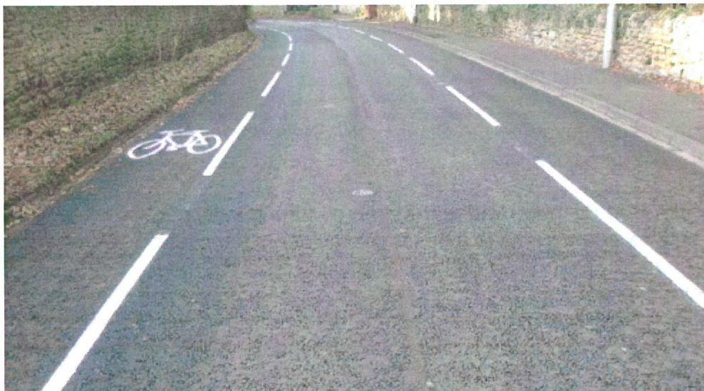
Fig 1. Newcastle Road with advisory cycle lanes, looking west