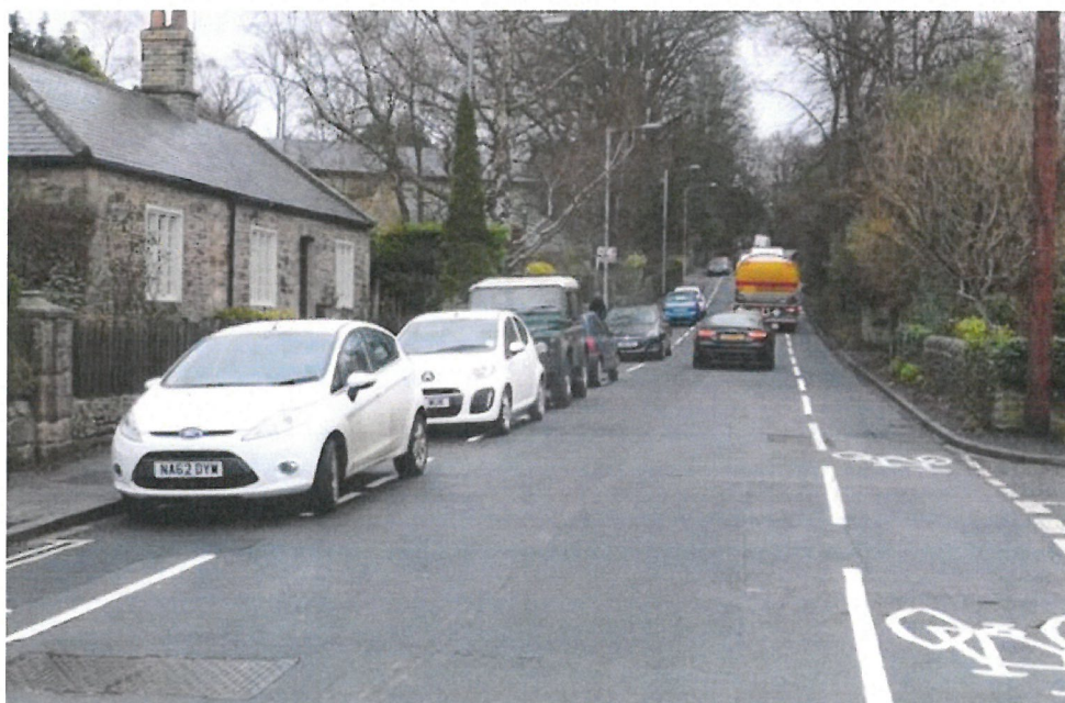
Fig 2. Parked cars affecting traffic flow (Jan 2016).