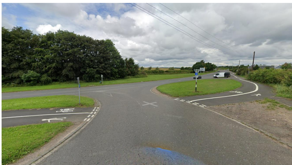
Fig.1: Existing layout of Whorral Bank and its junction with the HWRC access road, Morpeth

In addition, further concerns have been raised and observed relating to vehicles parking on the grass verge area and footway outside the garage premises opposite to the HWRC.