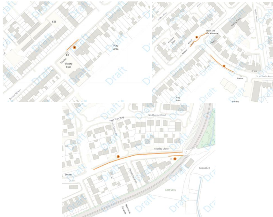
Fig. 2: Proposed 'No Waiting at Any Time' parking restrictions (A = orange) at Bristol Street & St. Michael's Avenue, New Hartley

In order to alleviate these issues, an extension of double yellow lines is proposed at this section of the U9706 route and shown below in Figure 2, whereas the existing restrictions are to remain in operation.