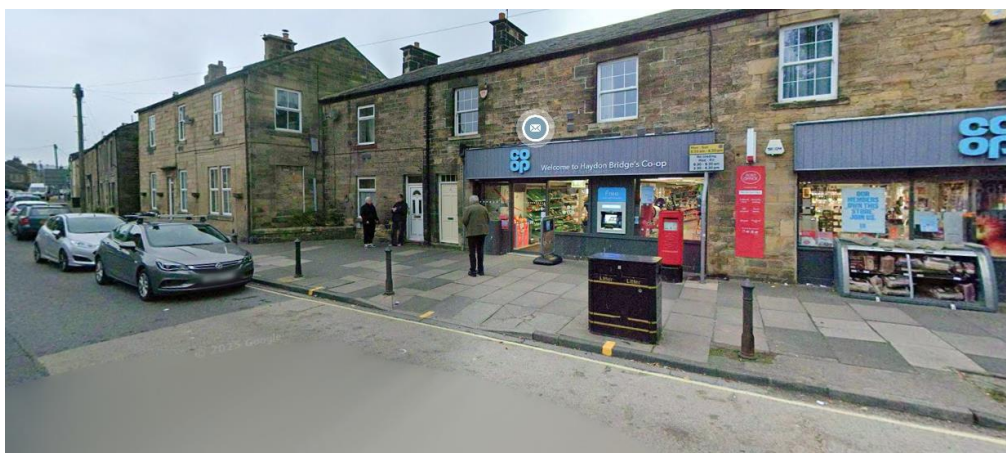
Fig.2: Existing layout on Ratcliffe Road, Haydon Bridge

Loading restrictions directly outside the Co-Op/Post Office prohibits vehicles from stopping there when deliveries are required and as a result, concerns have been raised regarding these existing restrictions as other kerbside parking spaces in the vicinity are regularly at full capacity throughout the day.