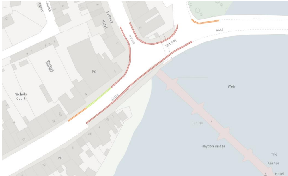
Fig.1: Existing parking restrictions at Ratcliffe Road near its junction with Church Street (red = no waiting or loading at any time, green = no waiting 8:30am-4:30pm & no loading Mon-Fri 8:30-9:30 & 2:30-4:30pm, orange = no waiting at any time)

The B6319 Ratcliffe Road is one of the main routes through Haydon Bridge and the properties situated adjacent to the road are both residential and commercial in nature, meaning kerbside space is at a high demand for on-street parking. Near its junction with Church Street, waiting and loading restrictions are in operation to maintain the free flow of traffic and prohibit obstructive and indiscriminate parking.