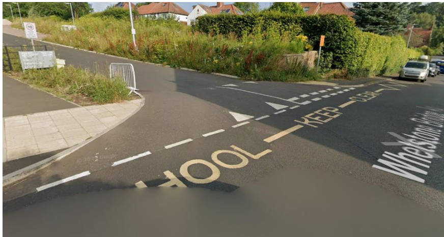
Fig.1: Existing access to QEHS car park via Whetstone Bridge Road, Hexham

Queen Elizabeth High School is a newly opened facility which is situated adjacent to Whetstone Bridge Road in Hexham. As part of the development, several accesses to the school were created via Whetstone Bridge Road and on-street parking restrictions implemented to maintain the free flow of traffic.