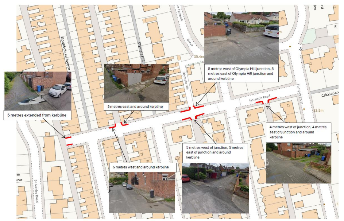
Fig. 1: Temporary double yellow lines on Morrison Road and adjoining junctions, Morpeth

Temporary 'No Waiting at Any Time' restrictions in the form of double yellow lines were installed on the same extents as the originally proposed restrictions in order to alleviate the issues so that refuse collections could be carried out and have proven to be a preferred option. The extents of these are shown in Figure 1 below.