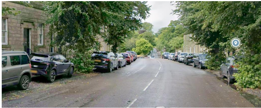
Fig.1: Existing layout of Bailiffgate, Alnwick

Bailiffgate is a single carriageway situated within Alnwick town centre with on-street parking available on both sides of the road, in the heart of a primarily built-up area containing a mixture of both residential and commercial properties. It is therefore a popular and busy destination with demand for parking spaces regularly at a premium.