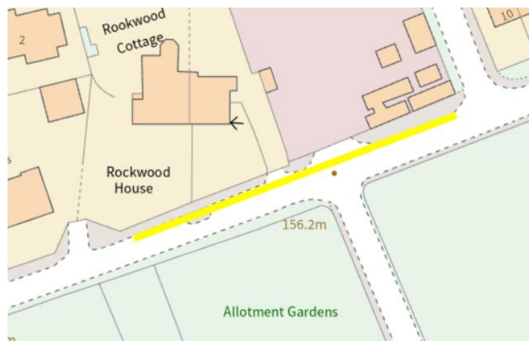
Figure 3: Inset showing the extent of the proposed double yellow lines.

Details of the proposals are shown on the plan in Appendix A. They are intended to improve road safety in the area.