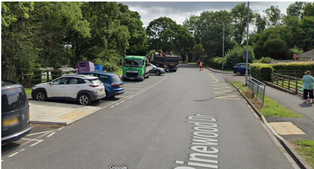
Fig. 1: Existing layout outside Morpeth All Saints Church of England First School

Pinewood Drive is a single carriageway road situated directly outside Morpeth All Saints Church of England First School and includes a school entrance access with informal parking bay arrangements that have been marked adjacent to this. This area is used as a pick-up and drop-off point by parents accessing the school during peak start and end times, with parking restrictions in the form of 'School Keep Clear' zig-zag markings currently in place directly across the school entrance to prohibit dangerous parking on Pinewood Drive.