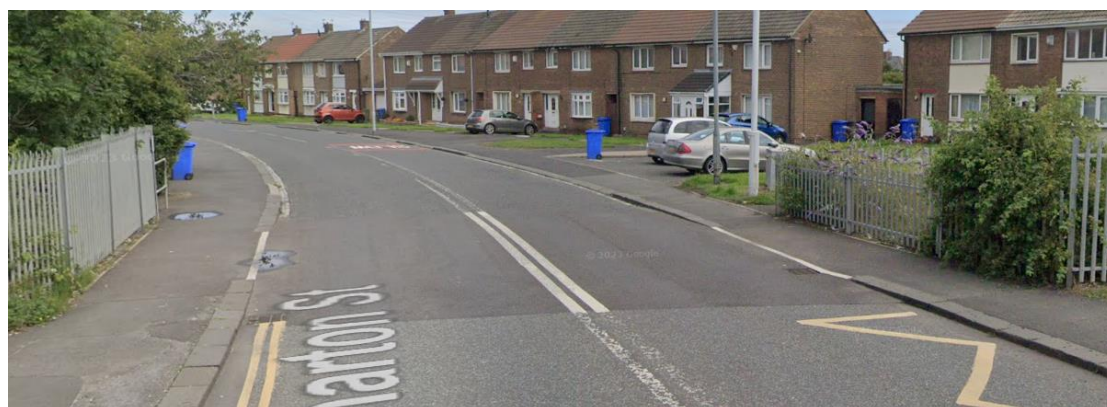
Fig. 3: End point of parking restrictions at Wharton Street, Blyth

'No Waiting at Any Time' restrictions in the form of double yellow lines are proposed on Wharton Street to cover the area between the 'School Keep Clear' markings to discourage obstructive parking and are proposed to extend further east beyond the old railway line to ensure this location, as observed in Figure 3, is also included within the restricted area.