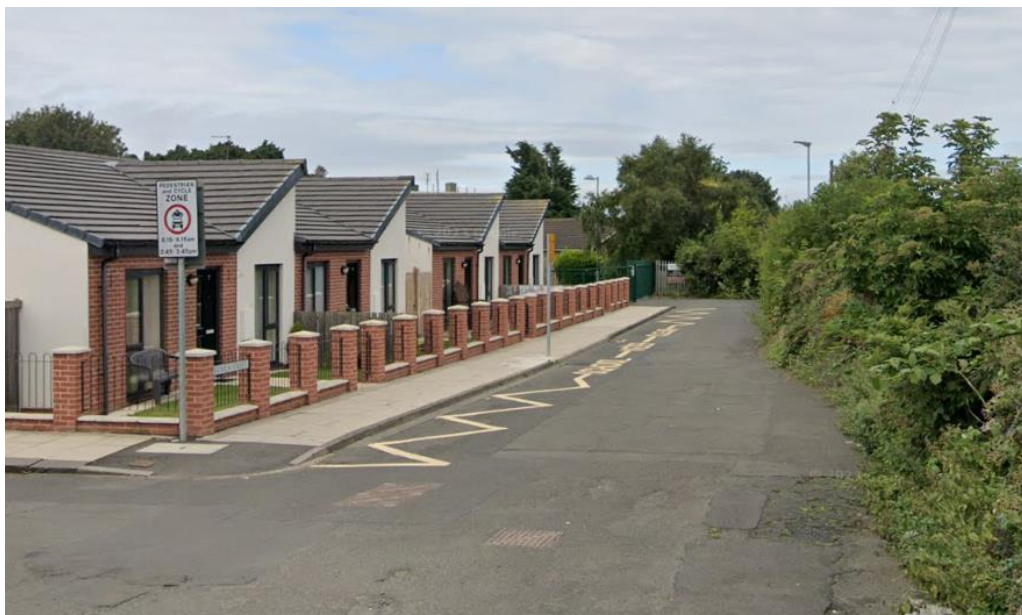
Fig. 2: Existing layout of Warwick Street, Blyth

In order to alleviate these issues, further parking restrictions are proposed outside the vicinity of the school's entrances on both Wharton Street and Warwick Street.