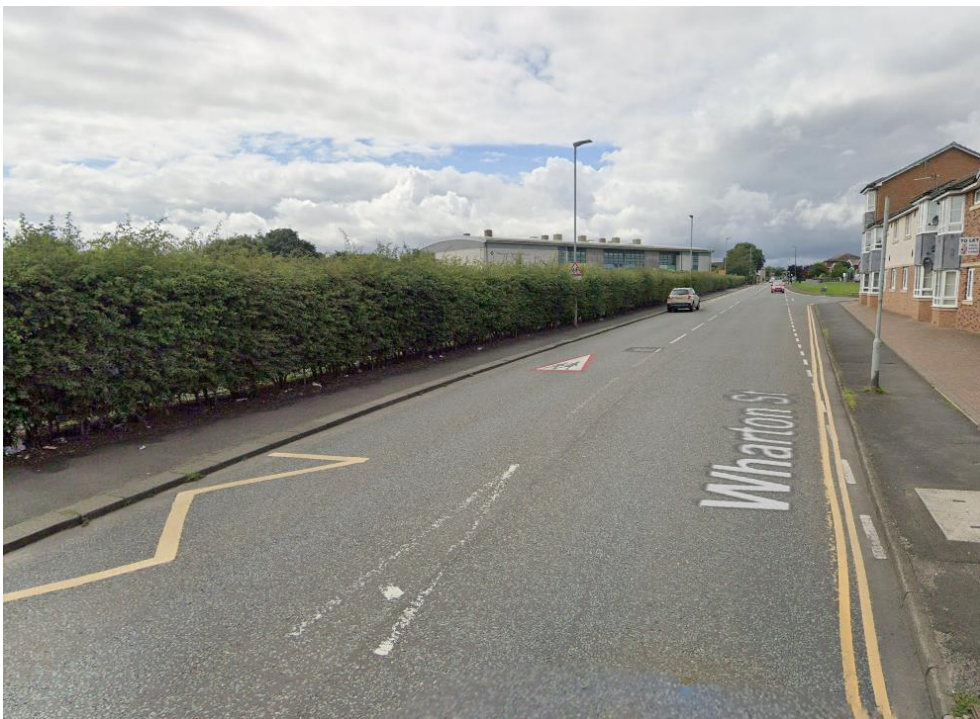
Fig. 1: Location of derestricted section of carriageway on Wharton Street, Blyth

Parking restrictions in the form of pedestrian crossing zig-zag lines, 'School Keep Clear' and 'No Waiting at Any Time' (double yellow lines) markings are in operation on Wharton Street to prohibit obstructive and indiscriminate parking directly outside the school, however a short section of the carriageway remains derestricted and is utilised as an informal pick-up or drop-off point during peak times and obstructs forward visibility along with the flow of traffic.