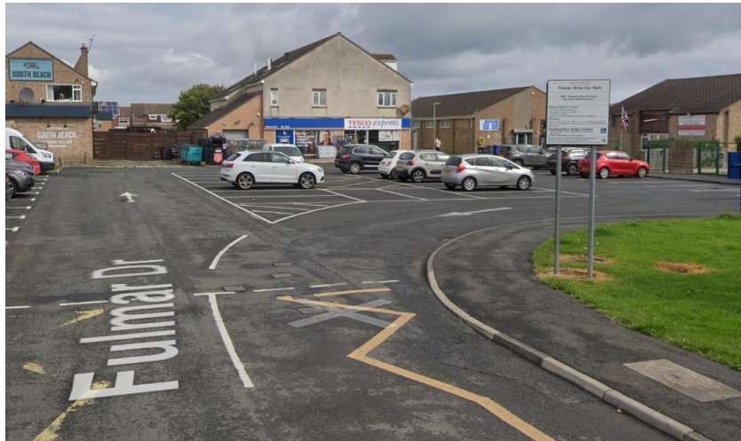
Fig.1: Fulmar Drive Car Park at the end of Fulmar Drive, Blyth

Fulmar Drive is situated south of Bede Academy and is one of the main access routes to the school. It is a single carriageway subject to a 20mph speed limit and at the bottom of the road a long-stay off-street car park is in operation as seen in Figure 1 below. Whilst this is used as the main parking facility during peak school start and end times, waiting and stopping restrictions are in place on Fulmar Drive in the form of double yellow lines and 'School Keep Clear' zig-zag markings to prohibit obstructive and indiscriminate parking due to overflow parking.