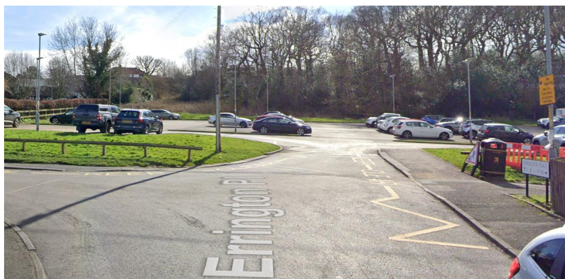
Fig.1: Existing parking restrictions at Errington Place & Fair View, Prudhoe

Parking restrictions in the form of 'School Keep Clear' zig-zag markings are in operation from Monday-Friday between the hours of 8am-5pm directly at the access to the car park, as can be seen in Figure 1 below, but the rest of Errington Place and Fair View is derestricted.