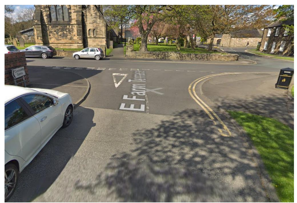
Fig. 1: Existing parking restrictions at East Farm Terrace in Cramlington

Parking restrictions in the form of 'No Waiting at Any Time' (double yellow lines) road markings are in operation at the entrance to East Farm Terrace and across the majority of the village square, which inevitably pushes parking problems into the street and increases during school start and end times.