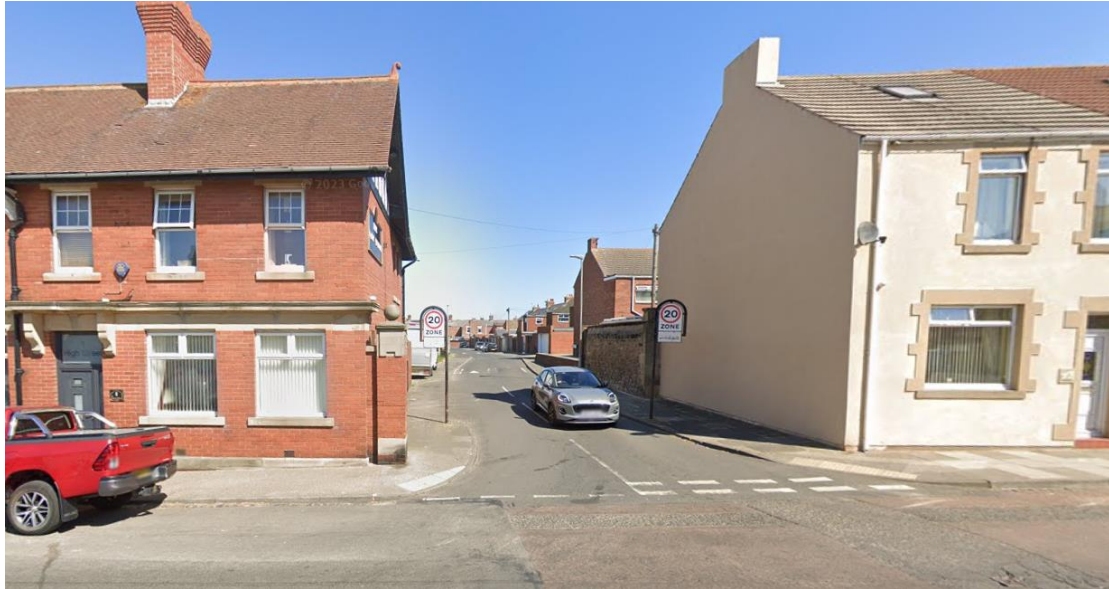
Fig. 1: Existing layout at High Street and its junction with New Queen Street, Newbiggin-by-the-Sea

High Street forms one of the main roads through Newbiggin town centre and is also primarily residential in nature, with the majority of properties having no off-street parking available. It is therefore often congested with vehicles either navigating through the route or parked using available kerbside space which is at a high demand.