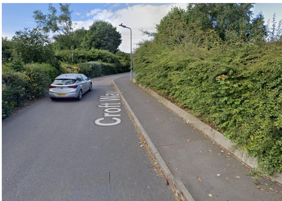
Fig.1: Existing layout of Croft Way, Belford where carriageway becomes narrow

Parking restrictions in the form of 'No Waiting at Any Time' (double yellow lines) road markings are in operation at the junction of Croft Field and High Street but the rest of the route is derestricted, meaning visitors to the surgery are able to park on-street despite off-street parking facilities being available. As the carriageway narrows on Croft Way, vehicles parked on this section of the road obstructs forward visibility for other vehicles navigating through the vicinity, as well as obstructing the footway for pedestrians.