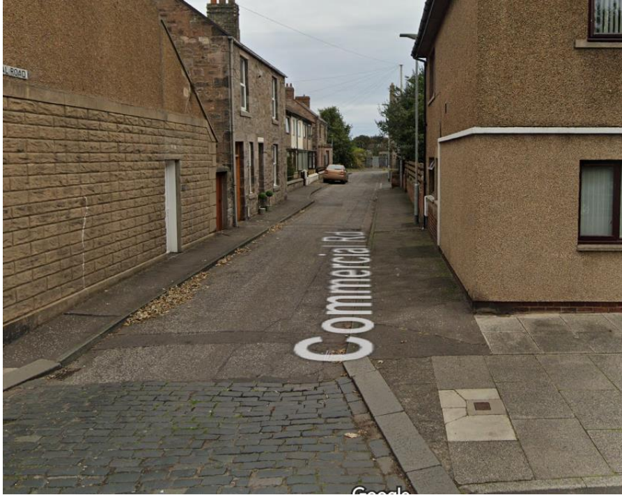
Fig. 1: Example of existing layout at Commercial Road, Spittal

Commercial Road is situated in the centre of Spittal and is primarily residential in nature with a narrow carriageway and footways adjacent to these properties. It is currently derestricted and as a result, the area is used for parking but causes obstructions due to the narrow widths here which forces pedestrians onto the carriageway or prevents vehicles from navigating in and out of the road.