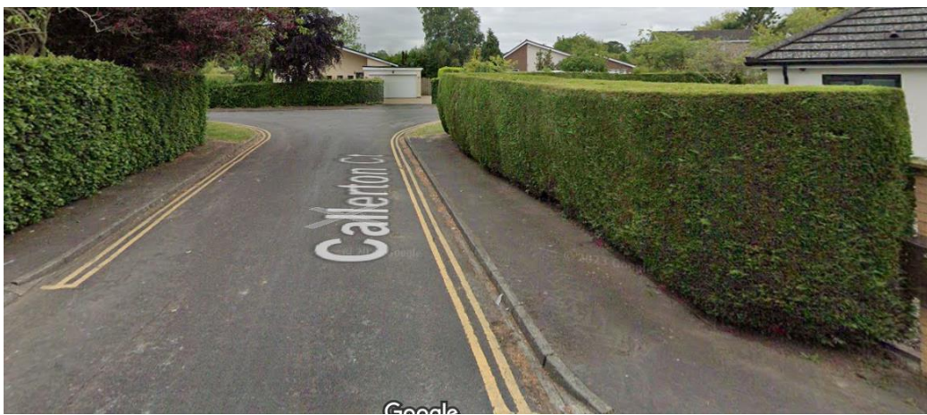
Fig.1: Existing double yellow lines at Callerton Court in Ponteland

Existing 'No Waiting at Any Time' restrictions in the form of double yellow lines are in operation at the road's junctions to discourage this practice, however the rest of Callerton Court is derestricted and vehicles parking here present challenges for residents by obstructing forward visibility and their access to off-street premises.