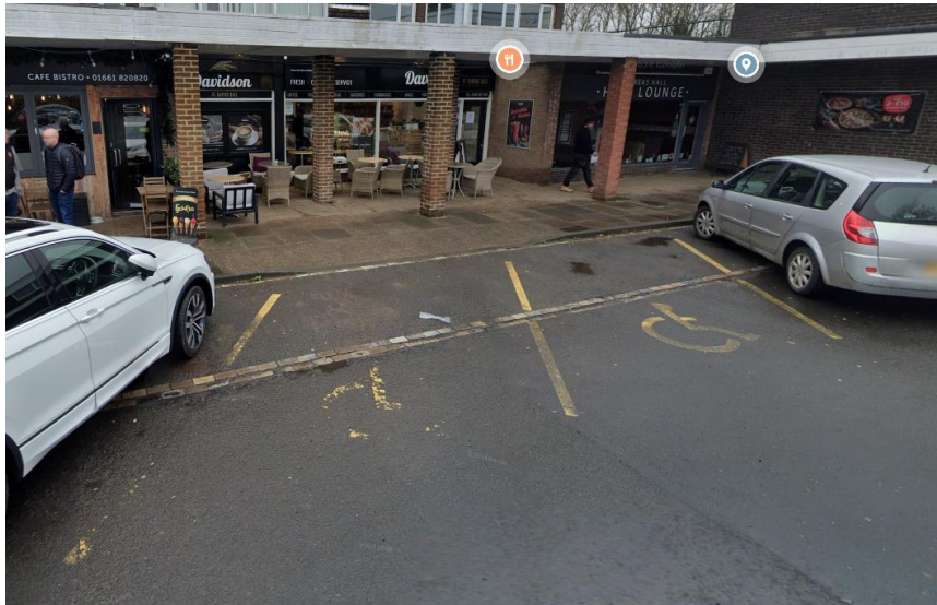
Fig. 1: Existing advisory disabled bays at Broadway shops, Ponteland

Local shops are situated on Broadway in Ponteland with parking facilities available adjacent to the carriageway, separated by a grass verge. Limited waiting restrictions are in operation for the standard parking bays with a maximum stay of 2 hours and no return within 1 hour to encourage vehicular turnover whilst allowing enough time for visitors to shop in the area. However, no restrictions are present on the marked disabled bays, which affords all motorists the opportunities to park in them and reduces facilities for Blue Badge holders.