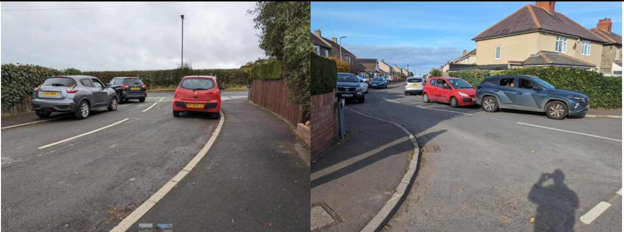
Figure 3 – photograph of a vehicle parked within 10m of the junction on Acklington Road.