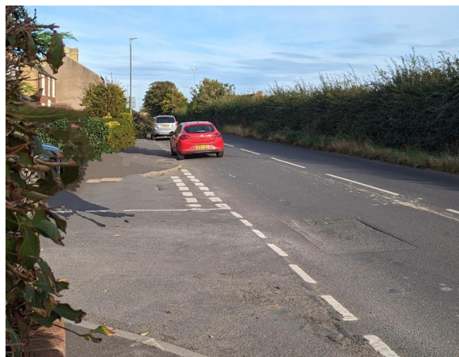
Figure 4 – Location of school crossing patrol (highlighted yellow) and location of parked cars on the opposite side (highlighted red) restricting visibility.