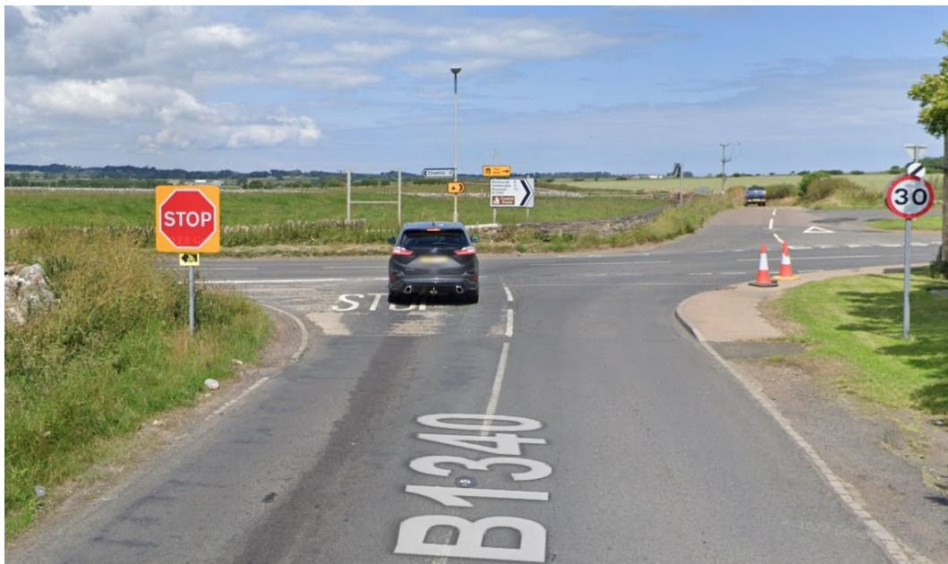
Fig. 1: Image of existing layout at northbound approach to Swinhoe Crossroads

Northumberland County Council is aware of road safety concerns at Swinhoe Crossroads, which are primarily due to poor visibility. This issue was the subject of a recent petition, signed by a total of 1019 signatories. A petition report in response was presented to the North Northumberland Local Area Council meeting of 28 th March 2023.