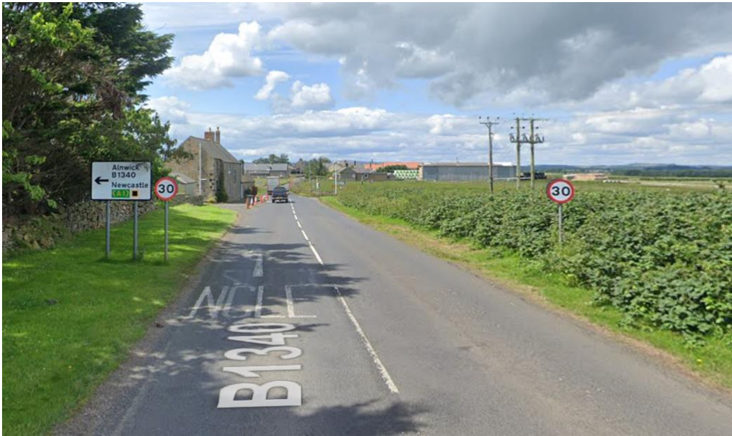
Fig. 3: Image of existing 30mph traffic signs at westbound approach to Swinhoe Crossroads showing beginning of restriction

Northumbria Police and the other emergency services will be notified of this amendment as part of the process for making the Traffic Regulation Order, along with all other statutory consultees.