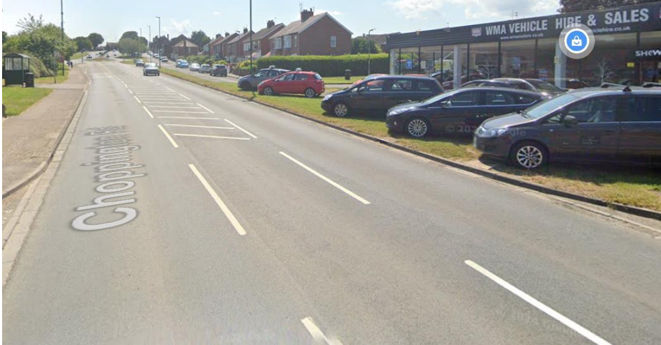
Fig. 1: Existing layout at A1068 Choppington Road in Bedlington

The A1068 Choppington Road is a single carriageway subject to a maximum speed limit of 30mph and is the main route linking Bedlington town centre with Choppington. There are no parking restrictions in operation throughout the route, but concerns have been raised regarding the car hire and sales garage leaving vehicles parked on the section of Choppington Road situated directly adjacent to the premises and on the adjoining grass verge.