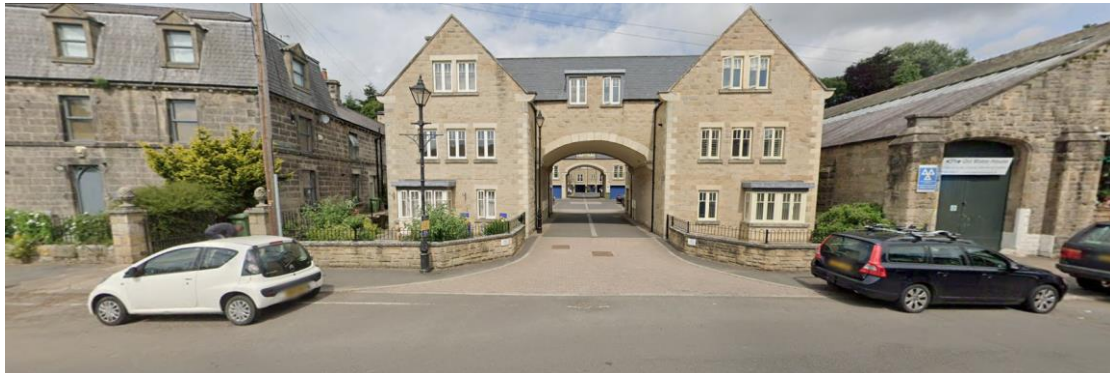
Google images of the access to Wrights/Lee Square from Town Foot

The ‘No Waiting at Any Time’ parking restrictions will be incorporated into the 20mph speed limit planned for Rothbury First School.