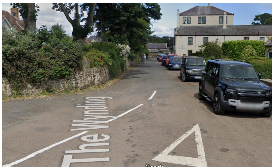
Fig. 1: Current layout of The Wynding, Beadnell

The Wynding is situated near the centre of Beadnell and is primarily residential in nature, with some commercial properties also present. At the southern extents of The Wynding, the carriageway is largely derestricted and visitors to the Beadnell Towers hotel often utilise this road for parking as demonstrated in Figure 1 below. Due to the narrow widths of the carriageway, this causes issues with obstructions and forward visibility, especially for those residents attempting to access their driveways.