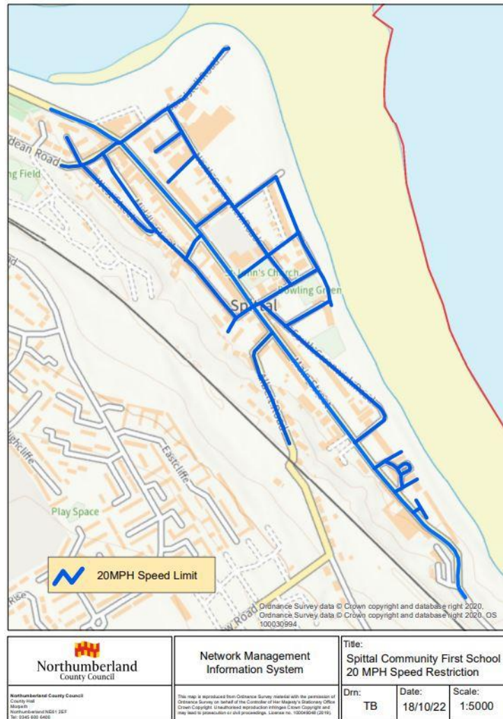
Fig. 2: Proposed 20 MPH speed limit extents at Spittal Community First School

Details of the proposals are shown on the plans in Appendix A. They are intended to improve road safety, reduce the risk of collisions and to protect the amenity of the area overall. Northumbria Police, other emergency services and relevant statutory consultees will be notified of these amendments as part of the process for making the permanent Orders.