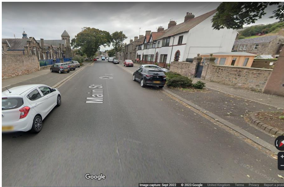
Fig. 1: Main Street in Spittal, directly outside Spittal Community First School

The introduction of a 20 MPH restriction on the roads adjacent to Spittal Community First School forms part of the 2022/23 Local Transport Plan. The scheme ties in with the County Council's road safety initiative to introduce reduced speed limits adjacent to all schools in Northumberland provided it is feasible to do so. Evidence suggests that measures of this kind adjacent to schools provide a safer environment for all road users.