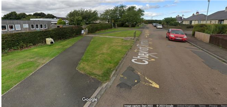
Fig. 1: Cheviot Terrace outside Scremerston First School

The introduction of the 20mph speed limit on the streets adjacent to Scremerston First School forms part of the 2022/23 Local Transport Plan. The scheme ties in with the County Council's road safety initiative to introduce reduced speed limits adjacent to all schools in Northumberland provided it is feasible to do so. Evidence suggests that measures of this kind adjacent to schools provide a safer environment for all road users.