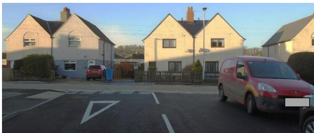
Fig. 1: Parking close to the junction and across the pedestrian crossing point at Queens Road

Concerns have also been raised at the junction of York Road and Victoria Crescent further south of the zebra crossing due to displaced parking following the implementation of the scheme.