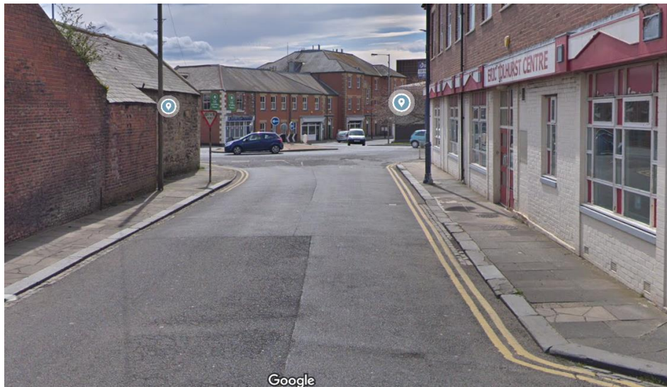
Fig. 1: Original layout of Quay Road between Bridge Street & Ballast Hill

Waiting restrictions in the form of double yellow lines to prohibit parking have been in place on the western side of Quay Road to maintain the free flow of traffic, especially for emergency services when entering or exiting their service station. Concerns have been raised with the local County Councillor regarding vehicles stopping on the existing double yellow lines directly outside the ADG Auction House, which, when other vehicles are parked opposite on the derestricted side of Quay Road, presents road safety issues through obstructing the flow of traffic, limiting forward visibility and, when mounting the footway, forcing pedestrians onto the live carriageway to navigate through the vicinity.