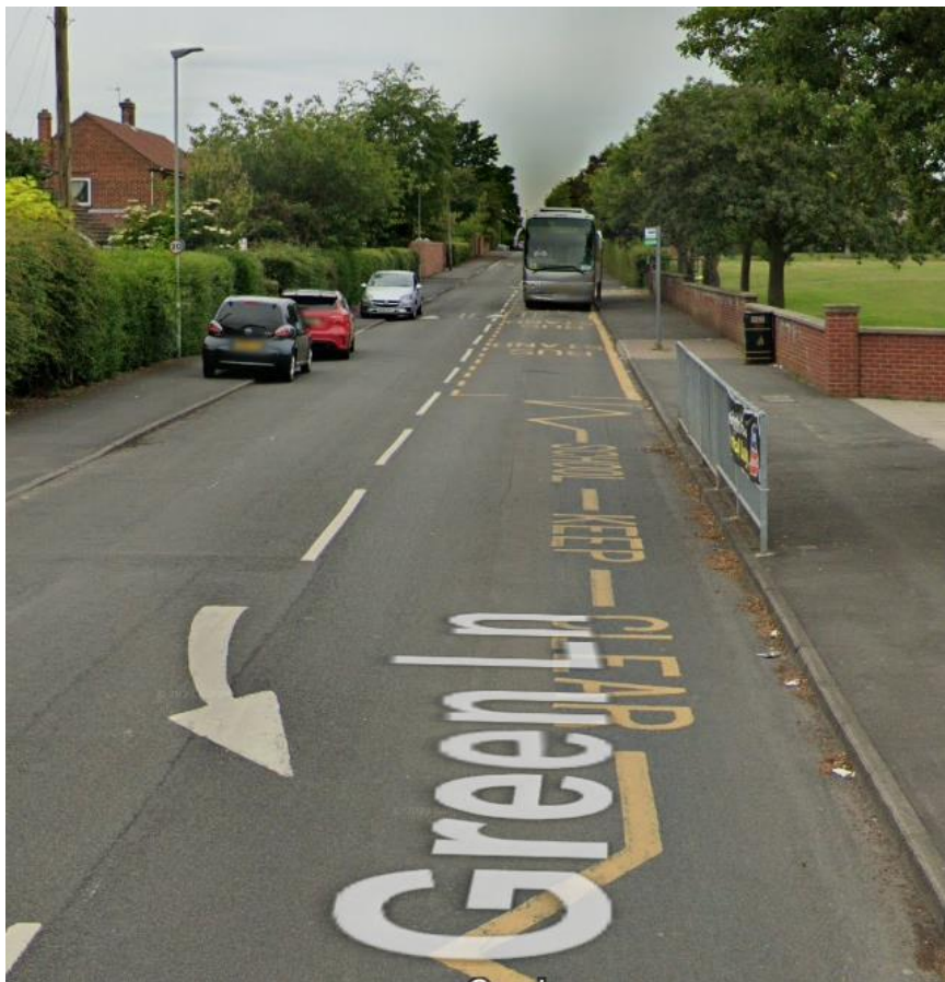
Fig. 1: Existing parking restrictions outside Ashington Academy

The route is used by school transport as the pick-up and drop-off point for buses and is regularly congested with parked vehicles during school start and end times. The only parking restrictions currently in place are 'School Keep Clear' zig-zag markings directly outside the entrance gates and a Bus Stand which has been marked to allow school transport vehicles to wait and manoeuvre without vehicles causing obstructions.