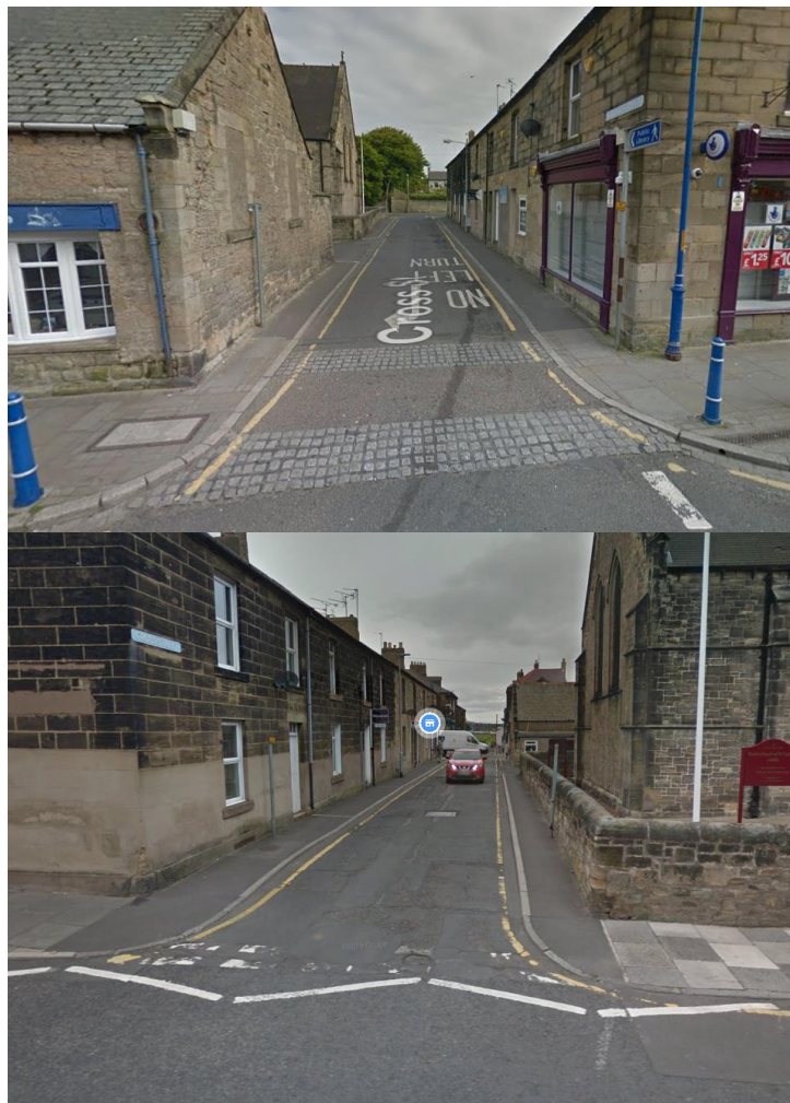
Google images of Cross Street

Residents have reported that there have been a number of “near misses” involving both vehicles and pedestrians. The council has therefore proposed that a one-way system be considered in order to improve road safety in the area.