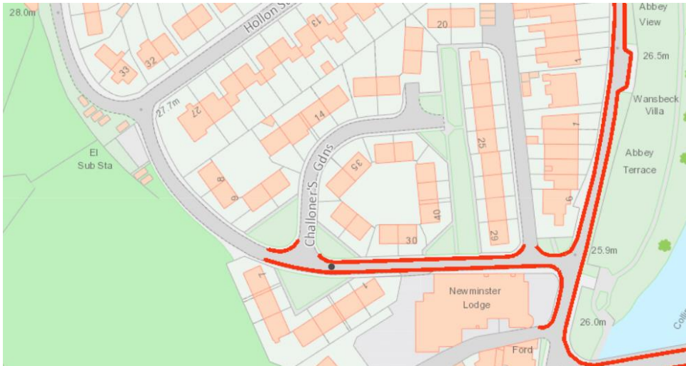
Fig 1: Double yellow lines on Challoner's Gardens indicated in red

The south-eastern section of the road is already covered by 'No Waiting at Any Time' restrictions to prohibit any parking here.