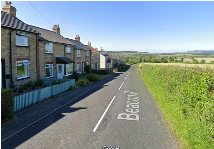
Fig. 1: Image of Beacon Road, Hampeth near residential properties

In addition, the footway on the southern side of Beacon Road where properties are sited is narrow, whereas no footpath is provided on the northern side of Beacon Road, which increases the potentially hazardous conditions without a sign posted speed limit.