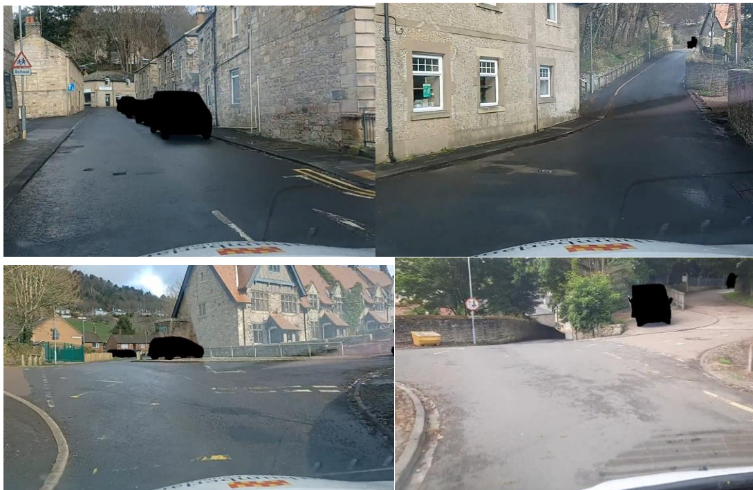
Vaisala images of Brewery Lane

The ‘No Waiting at Any Time’ parking restrictions will be incorporated into the 20mph speed limit planned for Rothbury First School.