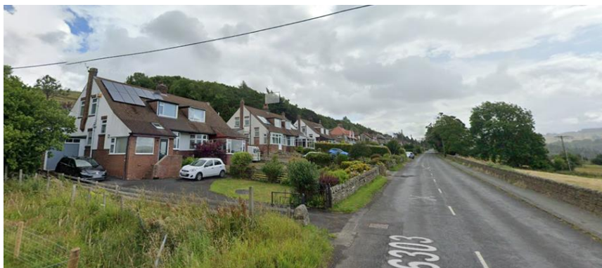
Fig. 1: Image of the B6303 Station Road near residential properties

In addition, there is no footpath provided on the eastern side of the road where the houses are sited, which adds further to the potentially hazardous conditions.