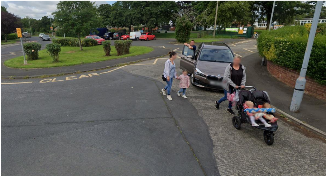
Fig. 2: Example of parking on the corner of Abbots Way, Morpeth