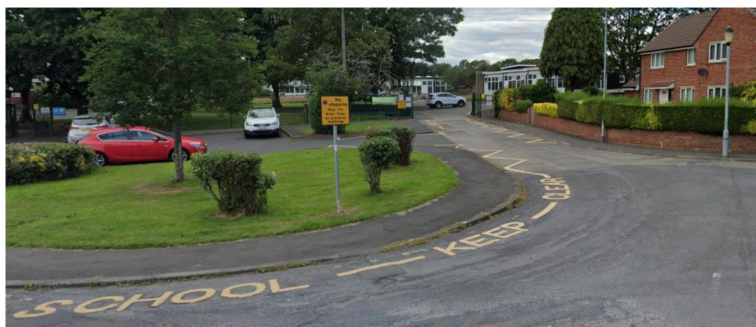
Fig. 1: Existing parking restrictions outside Abbeyfields First School, Morpeth

The area is used as a pick-up and drop-off point by parents accessing the school during peak start and end times, with parking restrictions in the form of 'School Keep Clear' zig-zag markings currently in place to prohibit dangerous parking on Abbots Way at the school entrance.