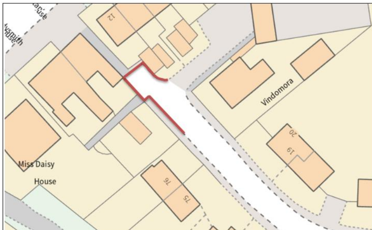
Fig.2 Consultation Plan