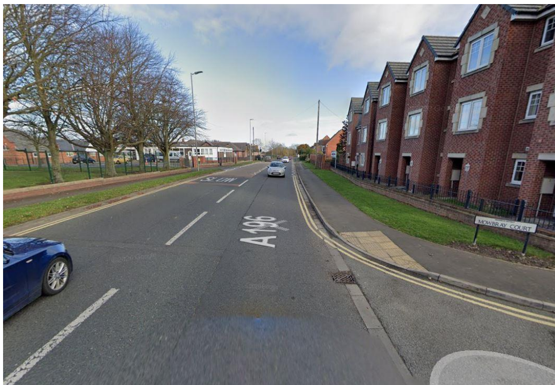
A196 Stakeford Lane Guidepost – Eastbound

See Appendix A – Scheme Plan Permanent Restrictions