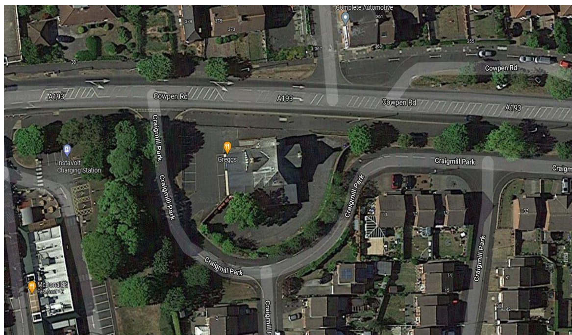
Satellite View – A193 Cowpen Road and Craigmill Park (Adjacent to Greggs)

NCC Parking Services will continue to carry out enforcement of these proposed permanent restrictions.