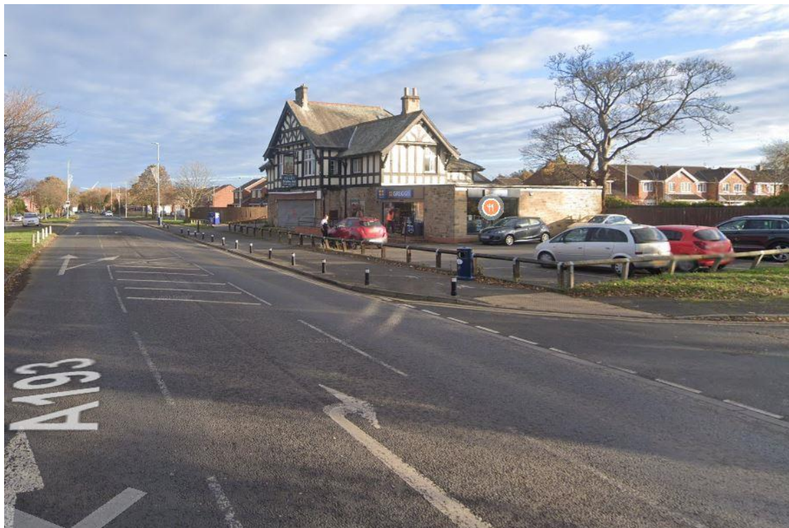
A193 Cowpen Road Eastbound Approaching Craigmill Park Junction