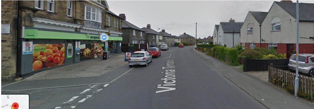
Fig 1: Existing road layout at Victoria Terrace directly outside the Co-Op

The U3129 Victoria Terrace is single carriageway subject to a 30mph speed limit, and is illuminated by street lighting at the general location of the scheme. A Co-Operative Food store operates along this stretch of road at its junction with Queens Road and is therefore a busy point for pedestrians crossing over Victoria Terrace, however no formal arrangements are in place to facilitate this, as is shown by the current layout demonstrated in Figure 1.