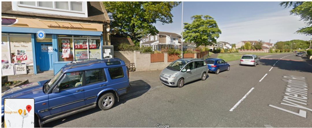
Fig 1: Vehicles parking along Lynemouth Road west of The Elms at local shops

Concerns have been raised with the local County Councillor regarding vehicles parking at this junction, which presents road safety issues for those navigating through the route, such as limited visibility and obstructing the movement of traffic.