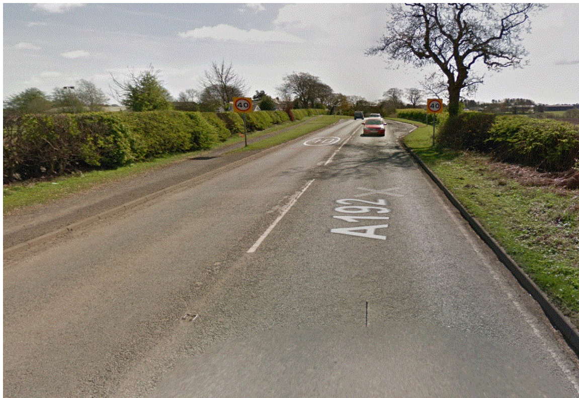
A192 South of Morpeth approaching Barmoor Bank

The 30 MPH speed limit was extended by way of the streetlighting regulations. A subsequent 40 MPH Speed limit was introduced by an Experimental Order TROM_070, to A192 Barmoor Bank. This provided continuity along the A192 south of Morpeth. It is proposed this 40 MPH speed limit section is now made permanent.