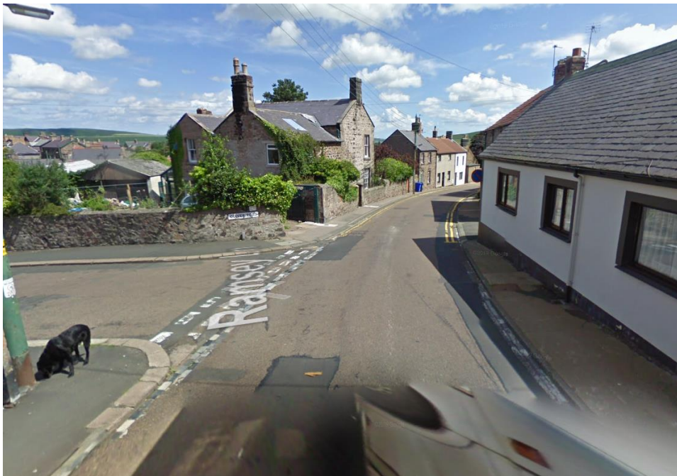
Fig 1: The junction of Oliver Road & Ramsey's Lane indicating the end point of the existing double yellow lines

Concerns have been raised with the local County Councillor regarding vehicles parking at this junction, which presents road safety issues for those navigating through the route, such as limited visibility and obstructing the movement of traffic.