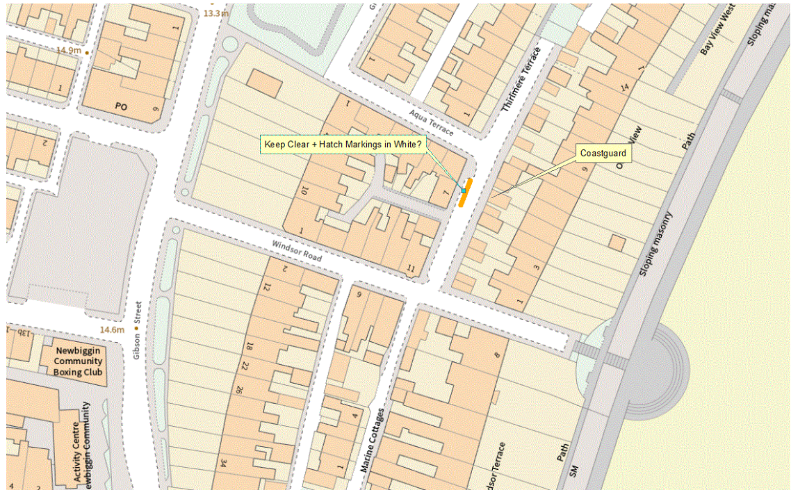
Location Plan - Ocean View Newbiggin - Detailing proposed Advisory Road Markings

These marking were agreed and implemented mid-March 2021.