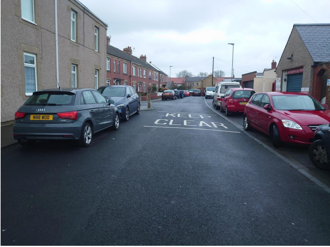
Photos taken March 2021 highlighting the parking issue - preventing access to the Coastguard building (on the right with the blue door)