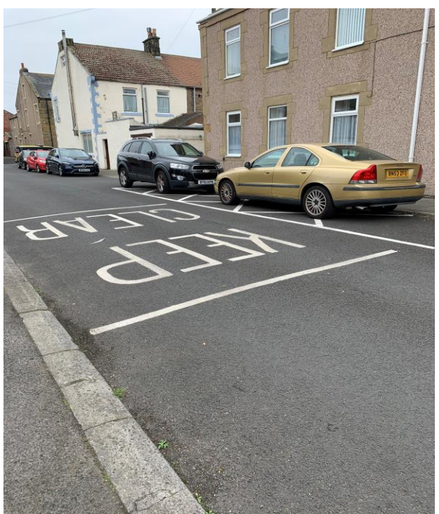
Recent photos highlighting the continued parking issue – September 2021

Northumbria Police, other emergency services and relevant statutory consultees including Local County Councillor and Town Council will be notified of these amendments as part of the process for making the permanent Orders.