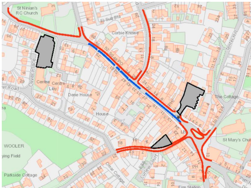
Fig 1: NWAAT (red), limited waiting parking (blue), off-street car parks (grey)

High Street in Wooler is located directly in the town centre and is therefore the most popular and accessed route for parking in the area. In order to protect the amenity of the area and facilitate the flow of traffic, 'No Waiting at Any Time' (NWAAT) and Limited Waiting restrictions are in place to discourage obstructive and indiscriminate parking, of which are highlighted below in Figure 1.