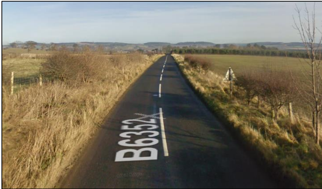
Fig.4. Looking north east along the B6352