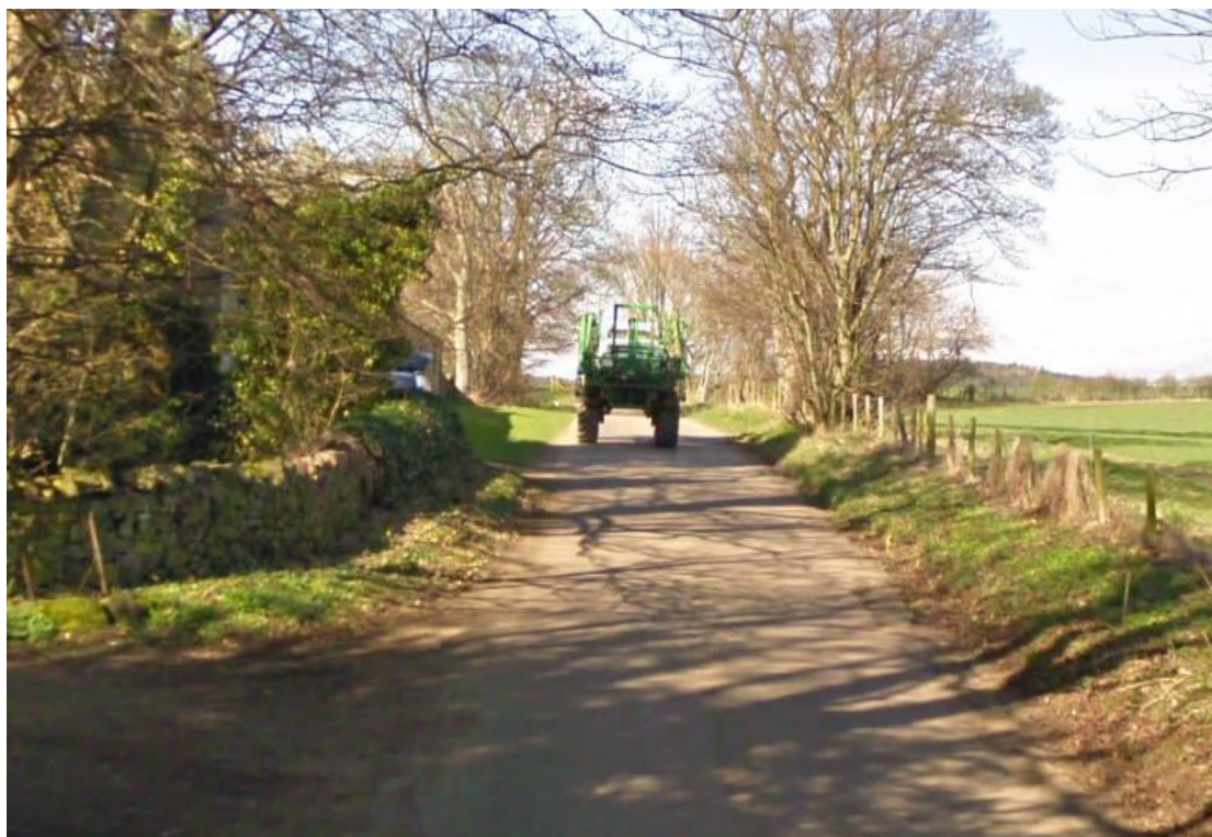
Fig.2. Looking north west at Milfield Hill