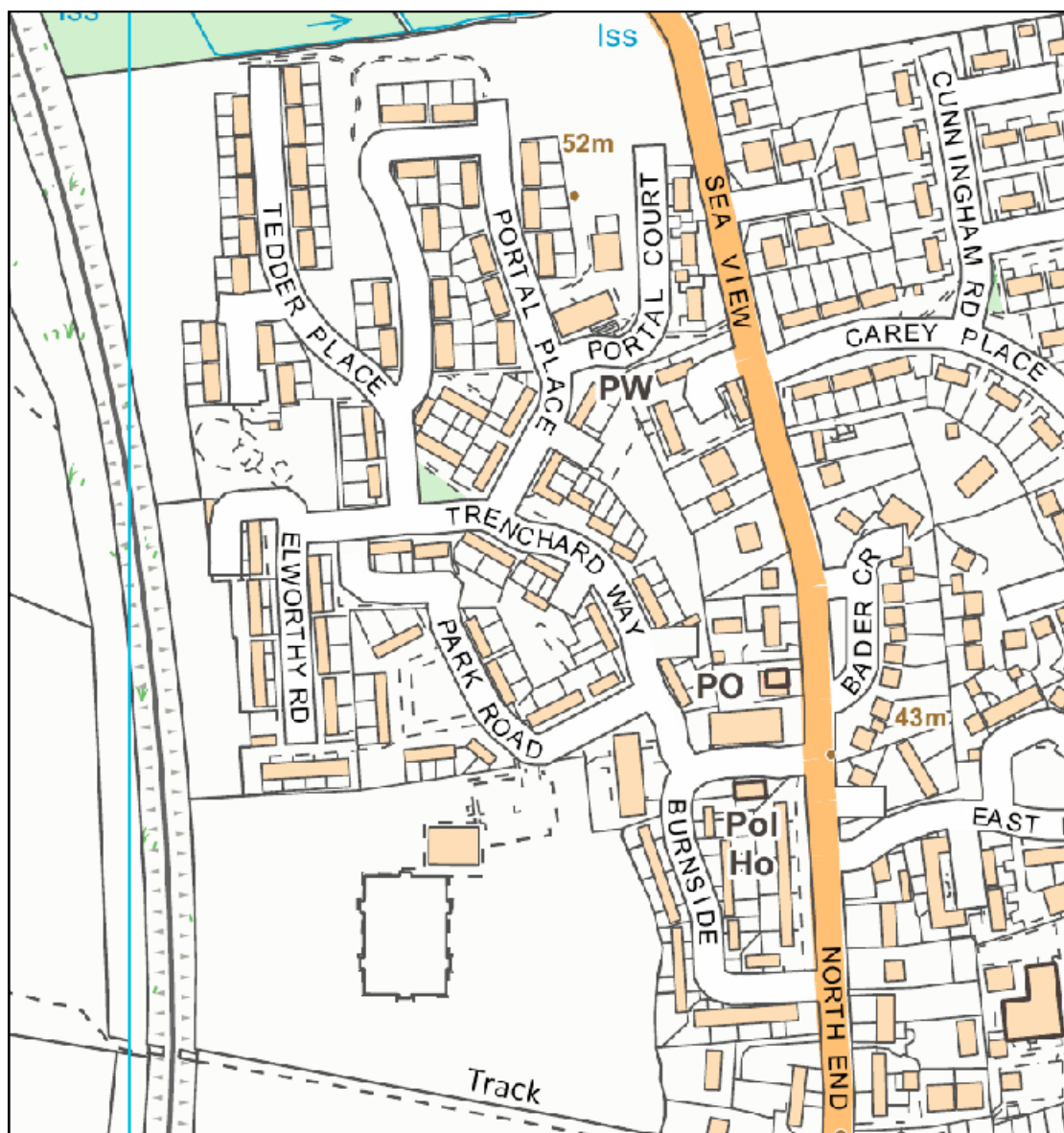
Fig.1 Burnside location plan.