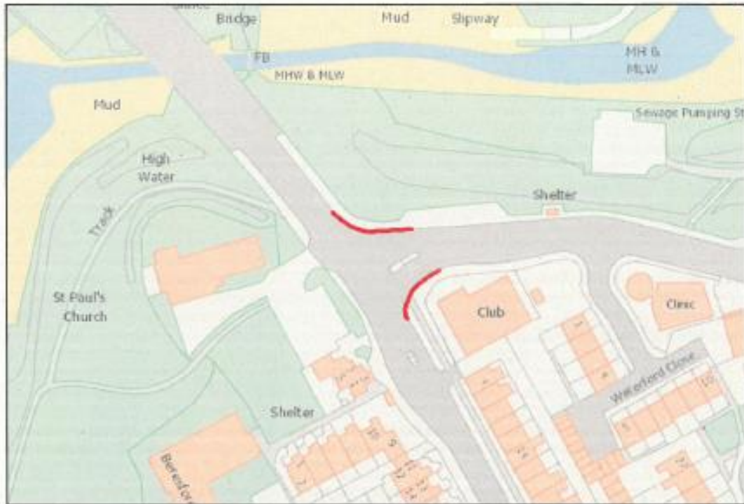
Proposed double yellow lines, A193 Beresford Road/Collywell Bay Road

Appendix C - Original Proposal Plan - A193 Beresford Road/Collywell Bay Road - To Proceed Unchanged