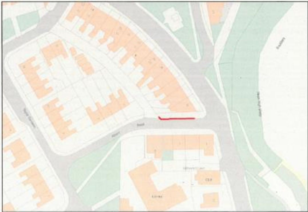
Proposed Double Yellow Lines Extension, Albert Road, Seaton Sluice

Appendix A – Original Proposal Plan - Albert Road- Not to Proceed