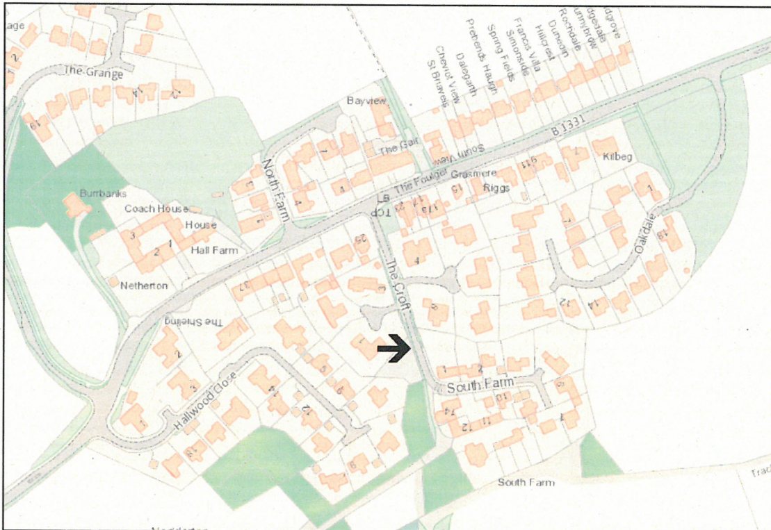
Fig.1. Location Plan